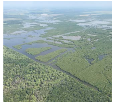
Land enrolled in WRP adjacent to mature forested wetlands