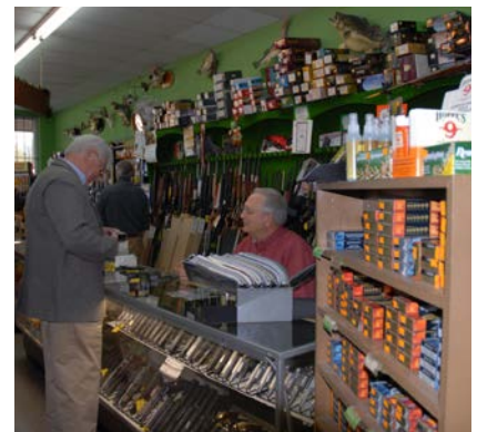
Hunters and anglers are having a major economic impact in rural America, as WRP/E increases wildlife habitat.