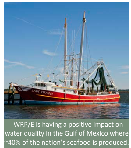
WRP/E is having a positive impact on water quality in the Gulf of Mexico where ~40% of the nation's seafood is produced.