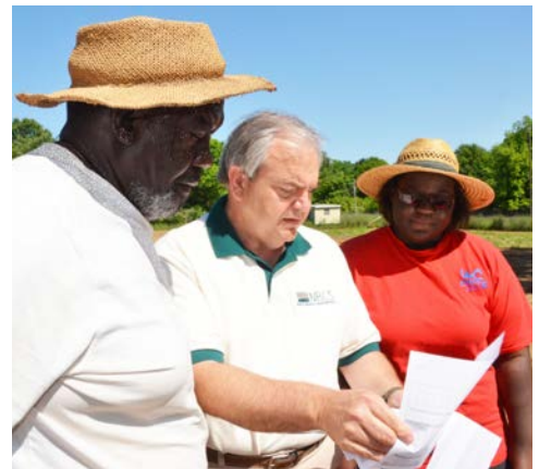
NRCS staff working with private landowners