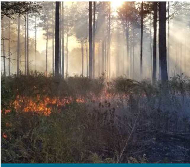
Prescribed fire, a cost-effective best practice for managing open pine

The Northeast Texas Conservation Delivery Network (NETX CDN) was formed in 2012 to focus conservation efforts north of the Longleaf pine region, targeting private lands conservation through its Habitat Incentive Program (HIP) since 2017. Once again, TPWD was (and continues to be) integral in both providing leadership within the CDN, and in providing substantial funds for HIP landowner assistance payments. TPWD's early state contributions leveraged a grant from the National Fish & Wildlife Foundation, and program delivery is being carried out by an array of partners, notably NWTF, TAMU Forest Service, American Bird Conservancy, USFWS and a host of others. The result has been a thriving partnership across NE Texas providing critical incentive payments to landowner cooperators on over 16,000 acres and counting, where prescribed fire, invasive plant control, and other key practices are improving habitat for our highest priority birds and other wildlife in open pine forest. And the work continues!