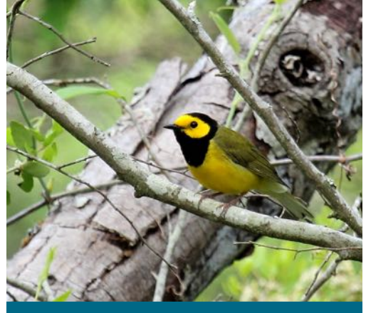
Hooded Warbler - James D. Childress

forest habitats. In BHW plantations for example, natural plant succession results in canopy closure and sparse understory vegetation. These conditions often persist until competition-induced mortality occurs or the stand