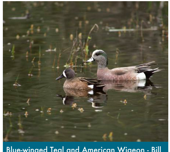
Blue-winged Teal and American Wigeon

We encourage you to visit the LMVJV's Wetlands Reserve Management Page (<a href="mailto:lmvjv.org/wrp-wre-management">lmvjv.org/wrp-wre-management</a>) to learn more and access these videos.