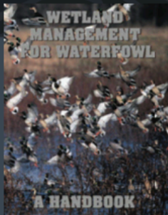
Wetland Management for Waterfowl: A Handbook