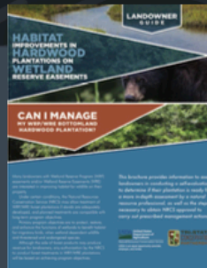
Habitat Improvements in Hardwood Plantations on Wetland Reserve Easements: Landowner Guide

https://www.lmvjv.org/s/wetlandmanagementhandbook.pdf